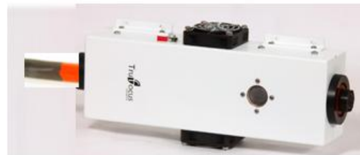
Packaged in a metal housing with FAN